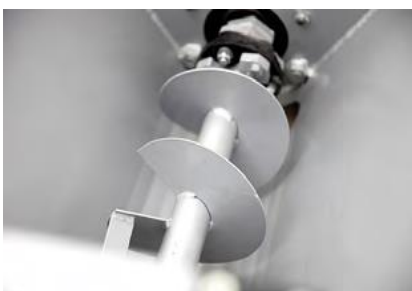
Two Joint Discs for Smooth Rotation