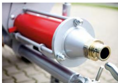
High Volume Worm Pump