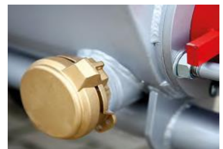
Large Opening for Cleaning

* Worm Pump * Grout Machine * Mortar Pump * Floor Screed Equipment * Liquid Screed Pump * Fine Grained Concrete Pump *